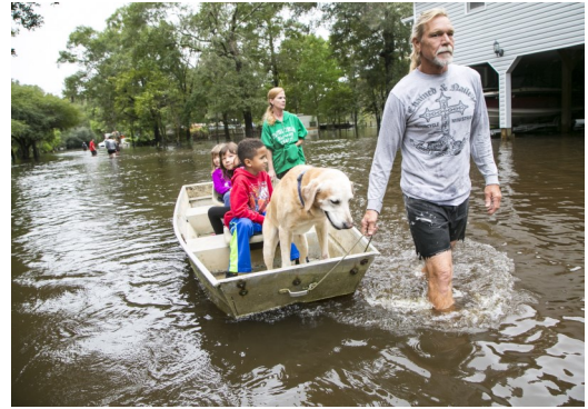
A family evacuates their home from flooding in South Carolina

The Southeast coast is experiencing severe and unprecedented flooding. At its height, more than 400 roads, 150 bridges and two major interstates (I-20 and I-95) were closed, isolating the communities that were most in need of comfort and assistance. South Carolina has borne the brunt of the devastation, enduring what has been described as a 1,000-year flood, and for some, more is still to come.